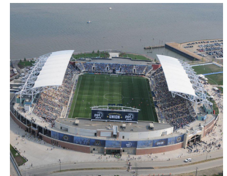
Philadelphia Union MLS Soccer Stadium Philadelphia, Pennsylvania